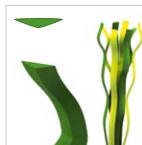
Fibre thickness: approx. 250 µm