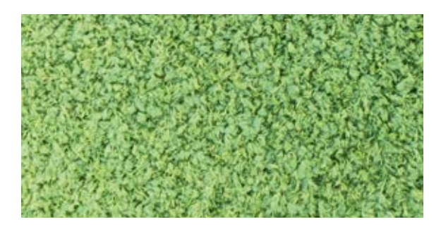
Hockey turf with regular use of ClearTurf M2 system