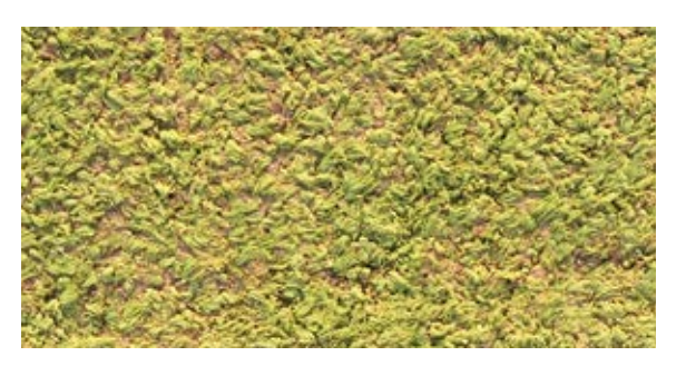
Hockey turf prior to using ClearTurf M2 system (or care and maintenance solution/cleaning solution)