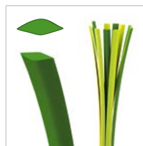
Fibre thickness: approx. 360 µm