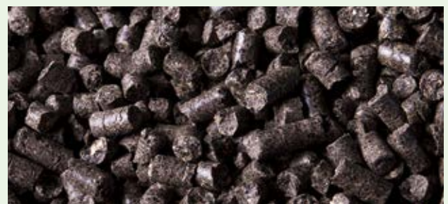
Base layer structure