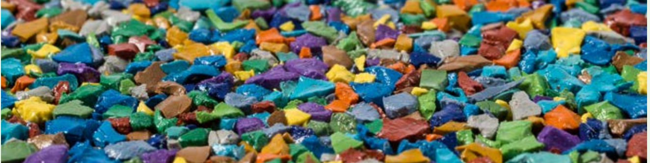
SOFT IMPACT SURFACE

PolyPlay FS GT (soft impact surface) is primarily used in playgrounds and kindergartens as a shock-absorbing surface in a variety of thicknesses. The granulated, water-permeable surface is particularly easy to maintain and thanks to its damping effect, it protects small children against injuries if they fall over, for example. Its ideal resistance to weather and rotting ensures a long lifespan and low maintenance costs. Compared to sandpits or bark mulch, soft impact surfaces are a considerably more hygienic and above all safe solution. Cardyon® is used in PolyPlay FS GT to achieve permanently elastic binding of the rubber granules, which also saves on CO 2 .