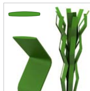
Fibre thickness: approx. 160 µm