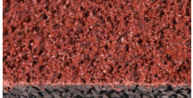
Spurtan WS RT

Water-permeable surfaces as well as water-impermeable surfaces can be provided thanks to the Re-Topping-Systems. Re-Topping-Systems are a very economical solution for refurbishing athletics tracks and sports facilities as the existing elastic substructures can be used again, meaning they are used over the long term and do not need to be disposed of. As a result, installation on the old surface is independent of the design of the initial installation, whether for in-situ surfaces or prefabricated track products. All re-topping surfaces have structured surfaces and are suitable for spikes, offering the optimal subsurface for professional applications. Re-Topping-Systems are frequently installed prior to IAAF competitions and are certified according to IAAF requirements.