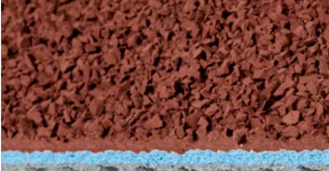
Rekortan M RT