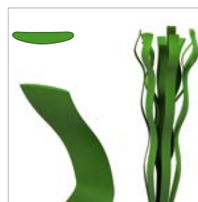
Fibre thickness: approx. 100 µm